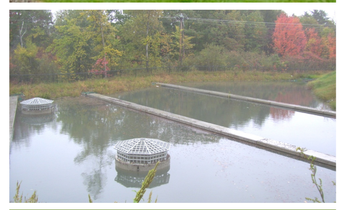
Assist and educate the public to promote stewardship of soil and water resources