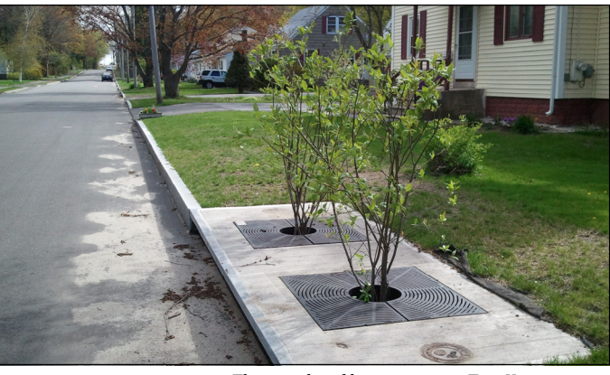
This tree box filter requires a Tier II inspection

Whether a yearly or five year inspection is required, all post-construction BMP inspections should be made by professionals trained and certified by the Maine DEP. These third party inspectors are able to document how well a site's BMPs are being maintained and if they are functioning as intended.