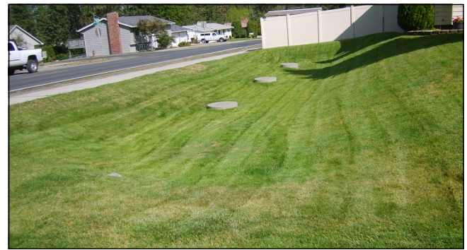
This vegetated swale requires a Tier I inspection

Best Management Practices, or BMPs, are designed to lessen the impact of development on local water bodies by reducing the volume of runoff and concentration of pollutants. Typical BMPs include stormwater infiltration systems, bioretention systems, stormwater detention facilities and various manufactured systems.